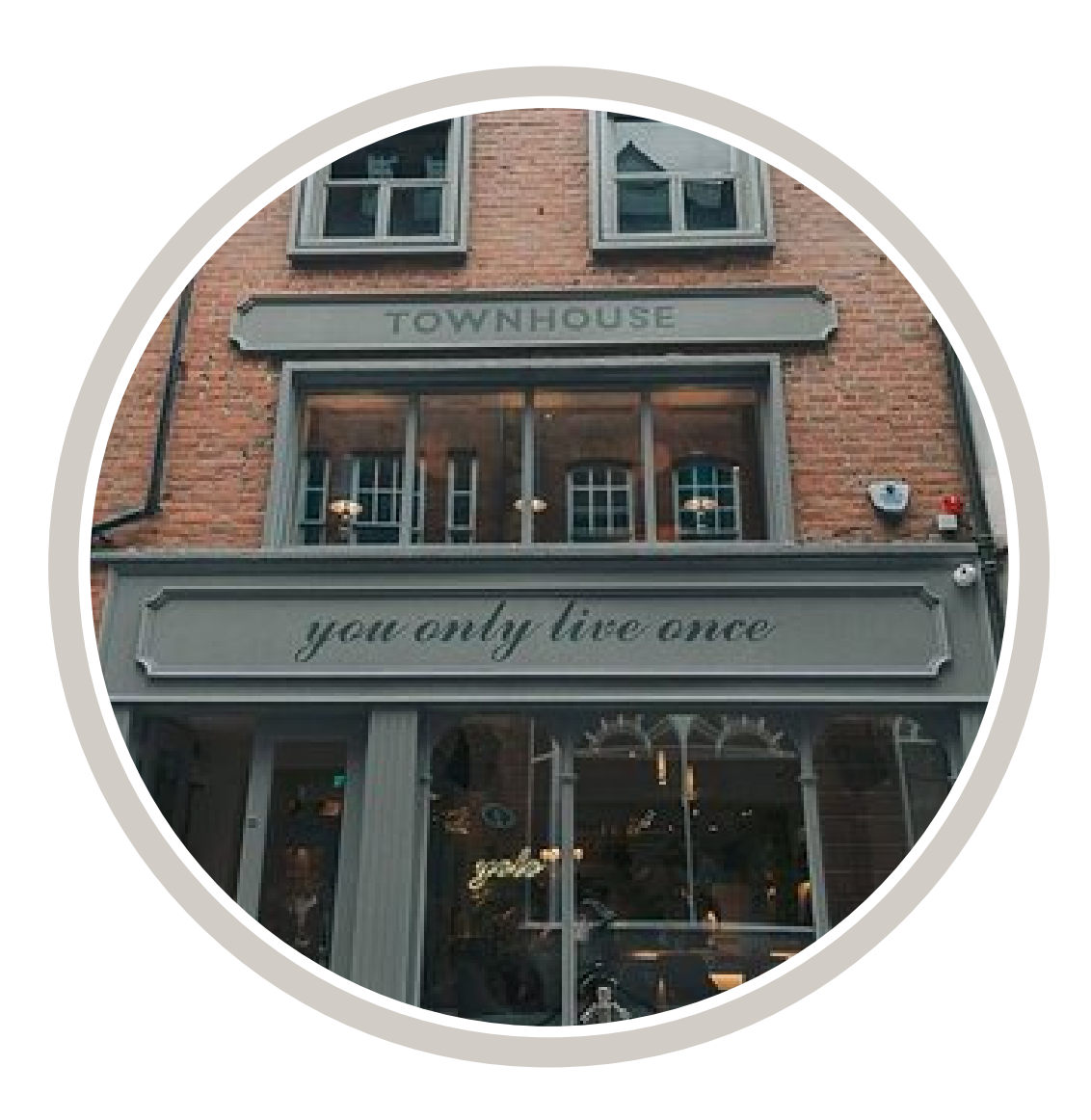
14 High Bridge | Newcastle upon Tyne | NE1 1EN